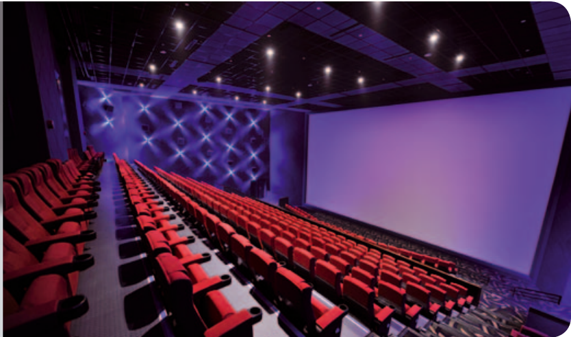
Barco Auro-3D 11.1 audio system at Wangfujing Cineplex, China