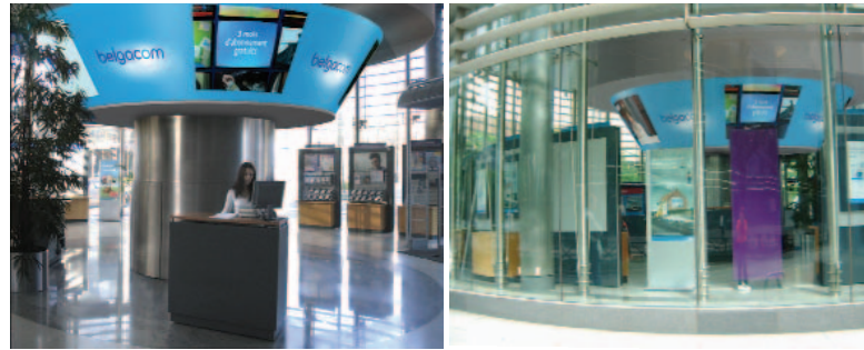
Animated project renderings

To make such an unusual display possible, Barco developed and installed a cluster of ten compact, 5,000 ANSI lumens SIM 5R projectors controlled by an XDS-1000 display management system. The SXGA+, single-chip DLP™ SIM 5R was chosen for the following reasons: