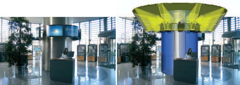
Original situation, before refit

Belgacom originally wanted Barco to replace its stale paper advertisements around the hall's central pillar with an array of LCD screens. Gradually, though, the company became aware that it needed a truly unique solution to assert its unequalled position in the market. Therefore, it accepted Barco's bold proposal to build a full 360° conical display around the pillar, the first and only in its kind.